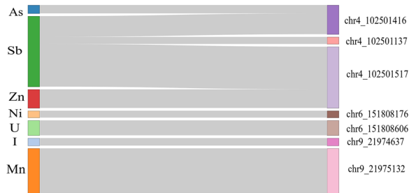
Fig. 3 CpGs associated with plasma levels of chemical elements. Sankey diagram visualizes the association between methylation status of CpGs (right) and plasma concentrations of chemical elements (left)